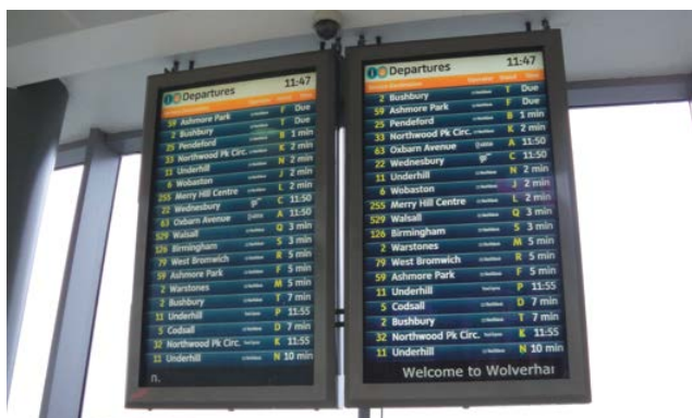
+ Wolverhampton real-time information display

show exactly where buses are, evidence clearly shows the speed and reliability of services can be improved through bus priority measures and that bus use can dramatically increase when such measures are implemented.